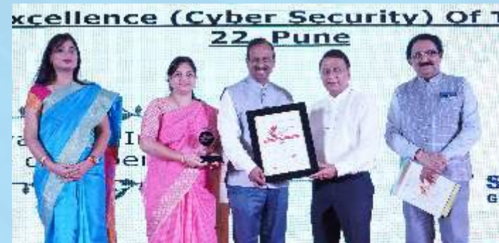
International Education Awards 2022