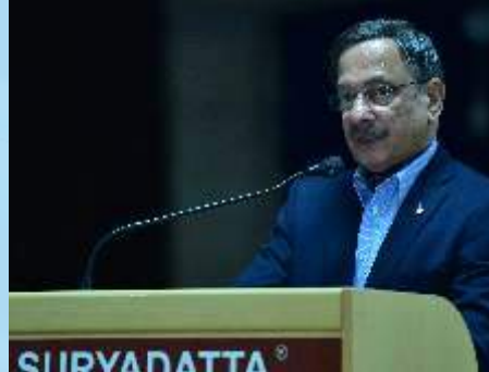
Air Marshal Bhushan Gokhale (Retd.)