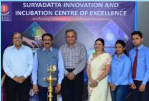
SIICE with Innovationext Inaugurated at SIM